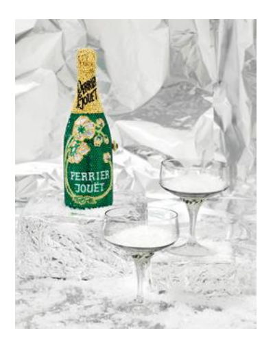
A Green & Gold Crystal PerrierJouet Minaudière, No 173/2500, Kathrine Baumann, 2000 Estimate: €1,500-€2,500